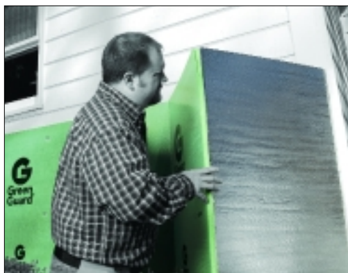
Product Shown: FP1450

For more information, contact your GreenGuard sales representative or visit green-guard.com .